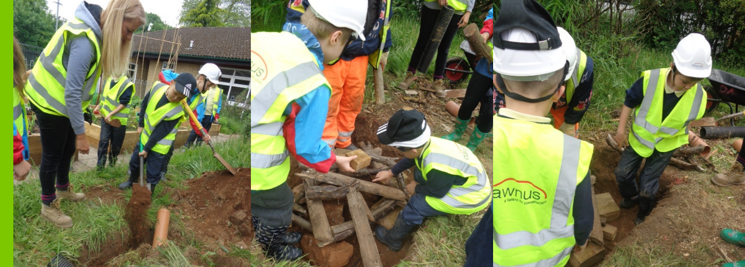
Gabalfa Primary School and Ysgol Glan Ceubal Hibernaculum

During the construction of the new school, it was decided that the site team would help construct a Hibernaculum in each of the three surrounding schools. A hibernaculum is a shelter in which insects, amphibians, reptiles and small mammals can hide during extreme heat and throughout the winter.