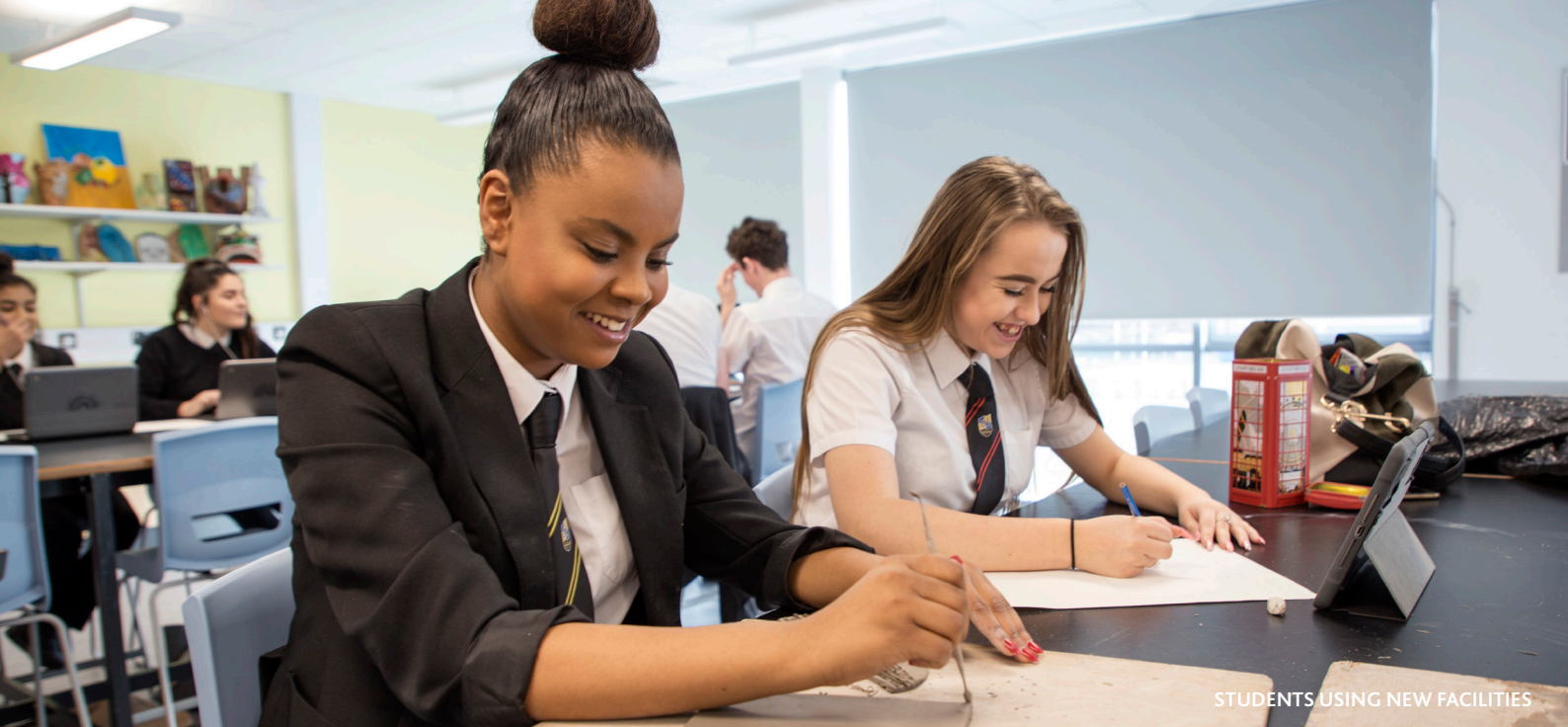
STUDENTS USING NEW FACILITIES